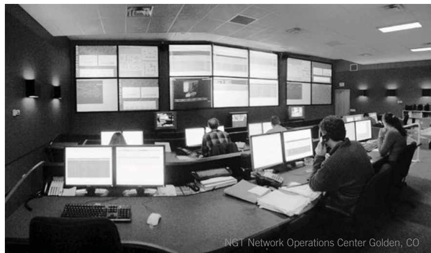
NGT Network Operations Center Golden, CO

The EdgeMarc 4500 is the ideal solution for business VoIP solutions and is fully integrated into the NGT Digital Voice service offer. It acts as a demarcation point for VoIP services by combining important VoIP, data, traffic management, diagnostic, and security functions into a single, easy-to-use network services gateway. Available in 10-call capacity that supports Ethernet connections, the EdgeMarc 4500 can be easily upgraded to 30-call capability as needed.